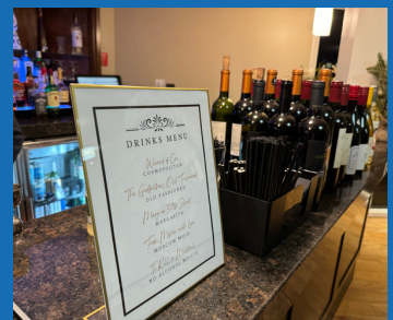
December 2, 2023: PFCU & PSFCU's First Year-End Staff Party